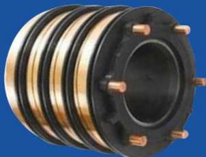
Slip Ring Unit 4 way Clockwise, Multifit Hub