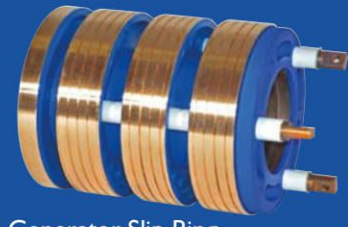
Generator Slip Ring For Gamesa Turbines