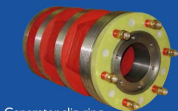
Generator slip ring Hitachi GE 1,5 MW