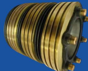
Generator Slip Ring For Slipping V90 and MK 7 and V100