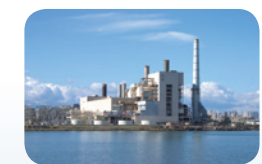
Industrial and Power